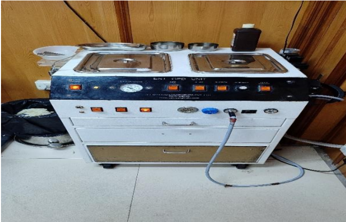
ENT OPD UNIT